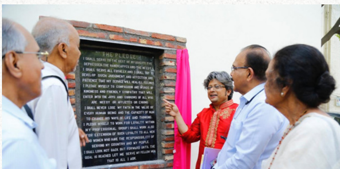
Social Work Pledge now part of the building